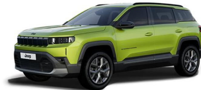
Model shown - New Compass First Edition e-Hybrid in Hawaii