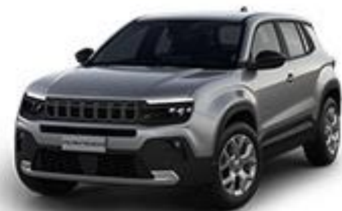
Model shown - Avenger Altitude 1.2 in Granite