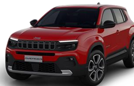
Model shown - Avenger e-Summit in Ruby