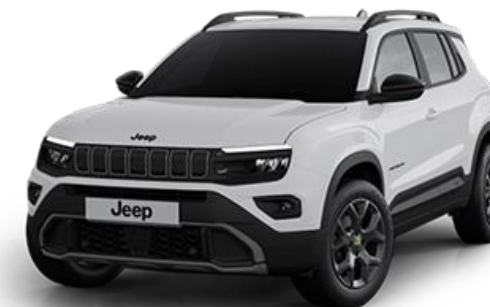
Model shown - Avenger Upland 4xe in Snow